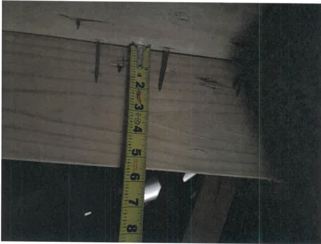
Figure 3 – Sheathing Fastener Size 8d Confirmed (Typical)