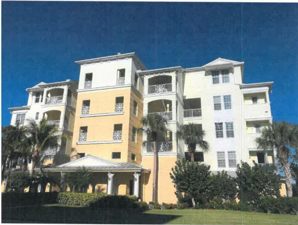
Figure 1: Typical 5-Story Roof Type (Metal) and Geometry (Hip)