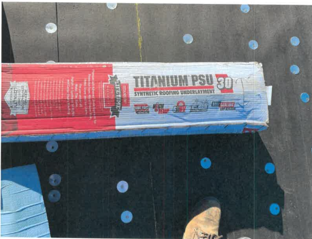
Figure 4 – Secondary Water Barrier at Sloped Section (Typical)