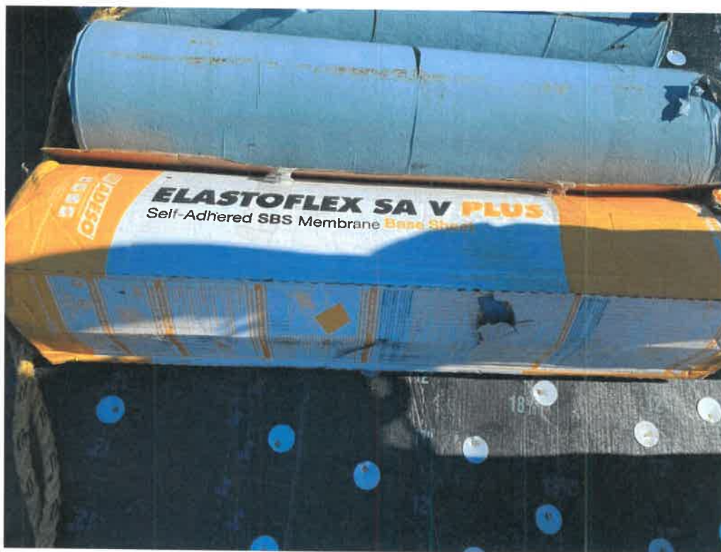
Figure 5 - Secondary Water Barrier at Flat Section (Typical)