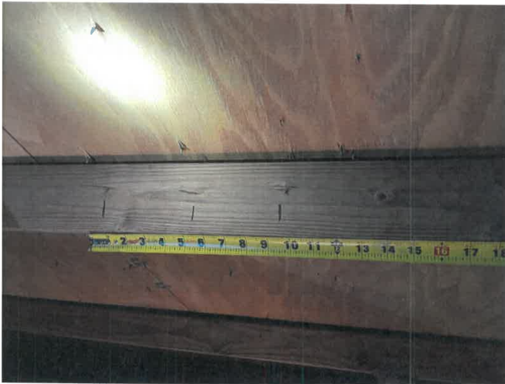
Figure 2 – Plywood Sheathing Fastener Spacing (Typical)